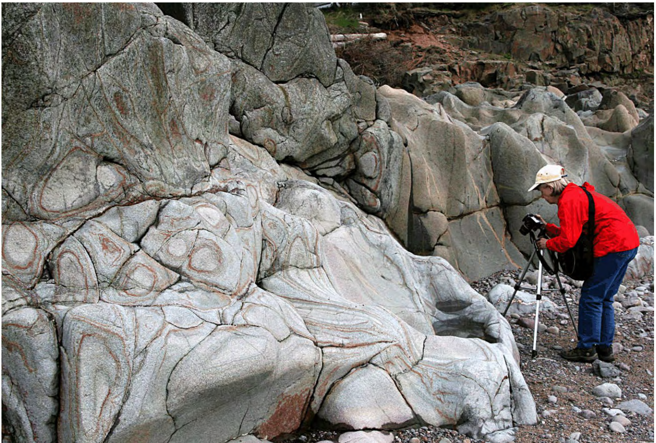
Carolynne Renton, of the Lighthouse photographic group, captures images of the lovely patterns in the Upper Flow Unit of the 200-million-year-old basalts at Margaretsville, on Nova Scotia's Fundy Shore. The patterns reflect the columnar structure of the flow.