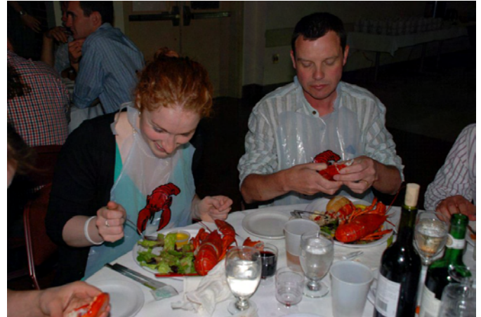
Conference delegates tucking into their lobster during the closing banquet ceremony.